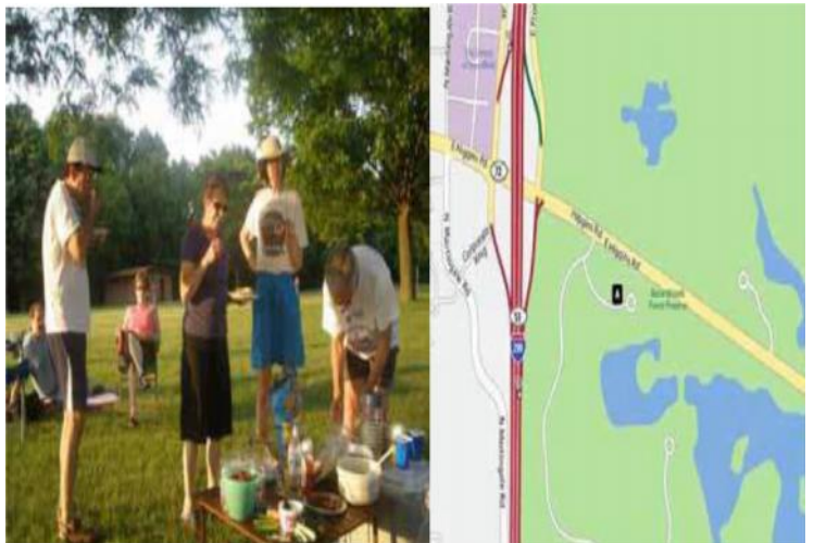
"A" Marks the Volleyball Location, same