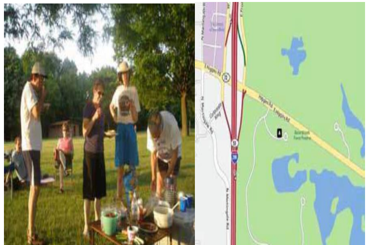
"A" Marks the Volleyball Location, same l